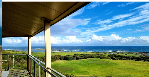
Restaurant balcony view, Boomerang by the Sea