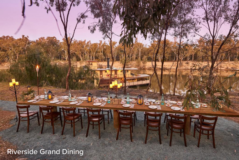
Riverside Grand Dining