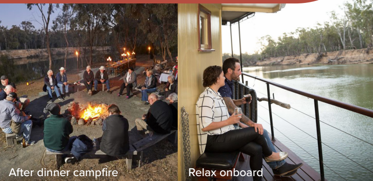
After dinner campfire