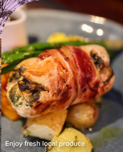
Enjoy fresh local produce