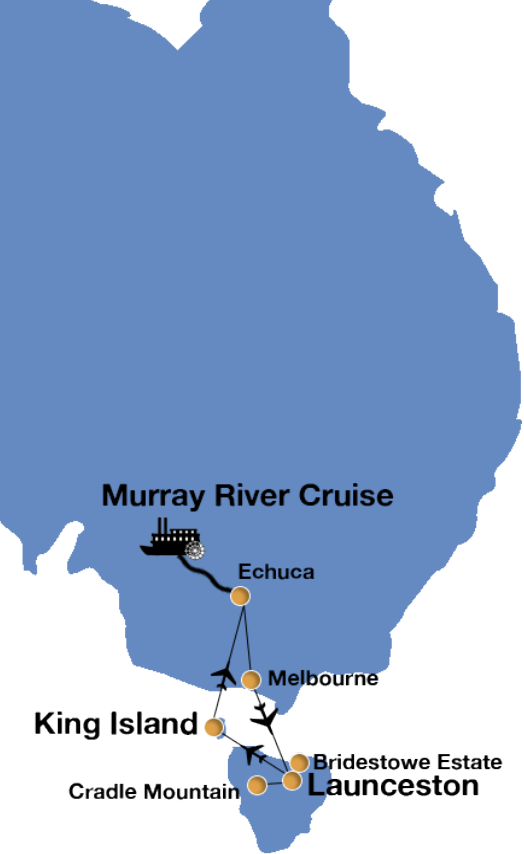
Murray River Cruise Echuca Melbourne King Island Cradle Mountain Bridestowe Estate Launceston