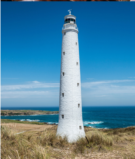
Cape Wickham Lighthouse

This morning, early risers can enjoy a riverside stroll before breakfast. A courtesy vehicle will then be ready to return us to Echuca, before our final transfer to Melbourne.