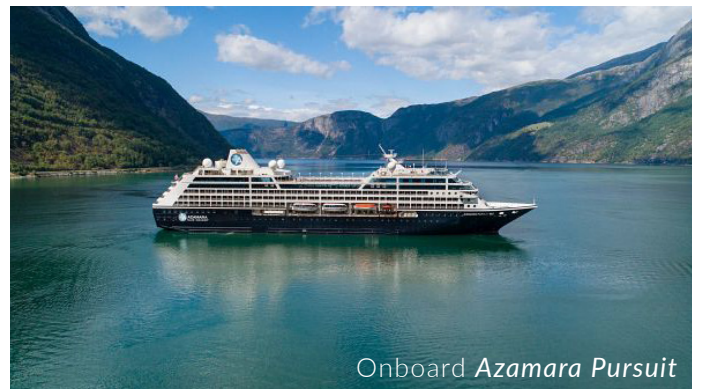
Onboard Azamara Pursuit