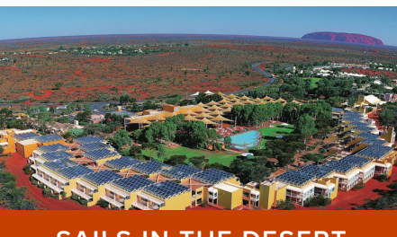
SAILS IN THE DESERT

Enjoy a drink and outback canapes whilst enjoying the sounds of the Didgeridoo at a stunning Uluru sunset.