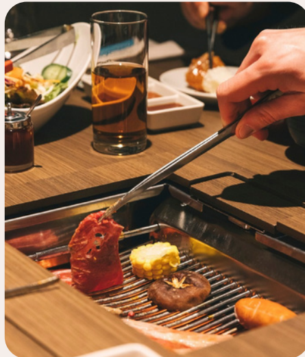
Gourmet Dining & Open Bar