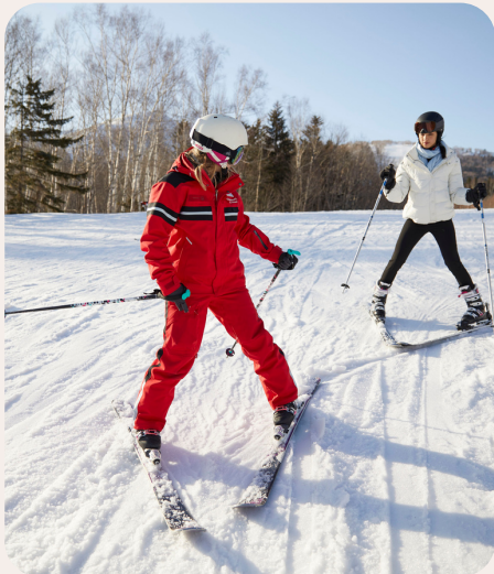
Lift Passes & Group Ski Lessons