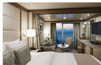
Superior Verandah from $22,499 pp twin share