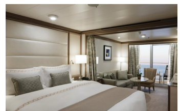
Deluxe Verandah from $23,499 pp twin share